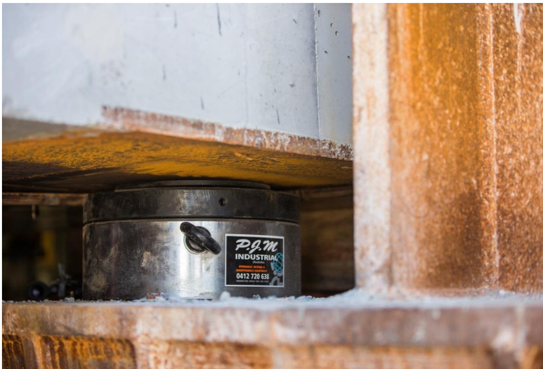
Shell House – Load transfer of Clock Tower.